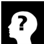
Vacant seat (assigned seat – Eastern Europe)